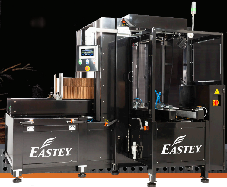
Right Hand, Right Open system shown