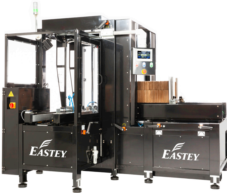
Left Hand, Left Open system shown