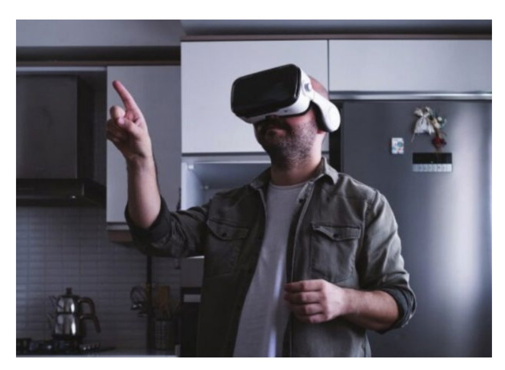
The metaverse being brought into packaging automation could look much more similar to playing a video game in which websites are three-dimensional virtual spaces.

Zuckerberg, are betting on it and investing millions in developing this future virtual space. However, only time will tell if or when the metaverse will come to fruition.