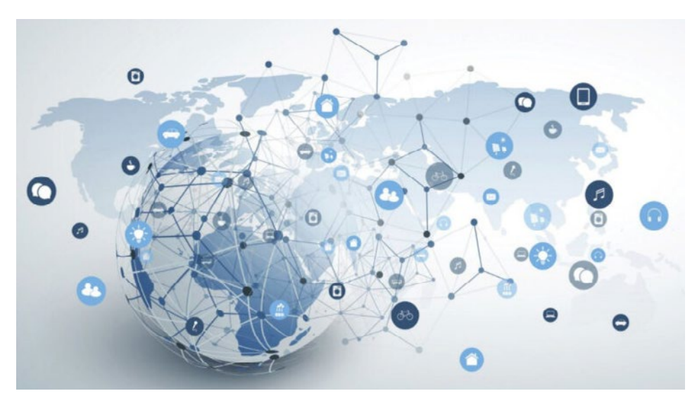
The IIoT is the future of complete atomization through the implementation of smart packaging machinery.

When will the metaverse arrive, and more importantly, will it arrive? Many CEOs of major corporations such as Facebook's Mark